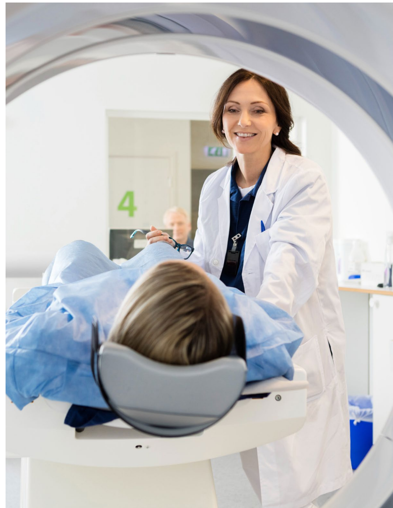
Physician and patient preparing for use of the Computed Tomography (CT) scanner.

With the expansion of the current footprint from 12,000 to 26,000 square feet, the new Milan and Maureen Ilich Medical Imaging Centre will accommodate more patients each year.